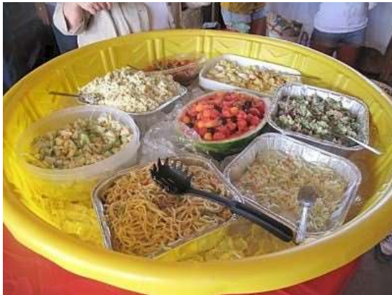
Cool idea: kiddie pool filled with ice to keep food cold

Put cold food in a cooler with ice or frozen gel packs. If you have it out for serving, set the bowl in larger ice-filled container. Keep cold food at 40° F or less.